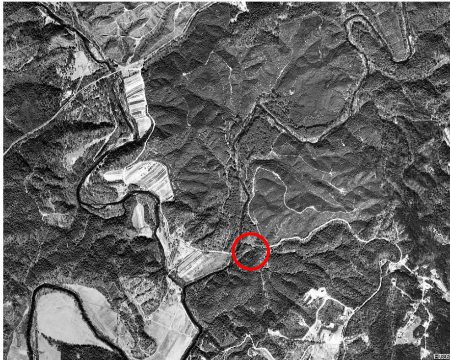
USGS Orthophotoquad: Collettsville 7.5' Quadrangle 3-15-98